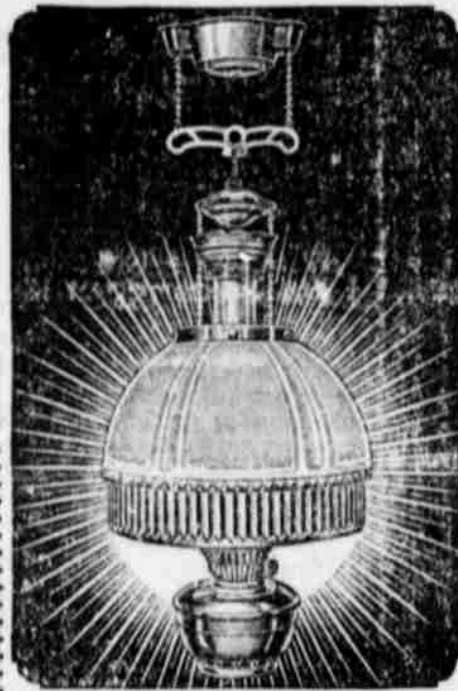
Beautiful Hand Decorated Shades in Glass and Parchment With the Aladdin now equipped with these exquisite shades, you can light your home not only as efficiently as city homes but just as artistically as well. Several charming designs from which to choose.

THE PACIFIC TELEPHONE AND TELEGRAPH COMPANY