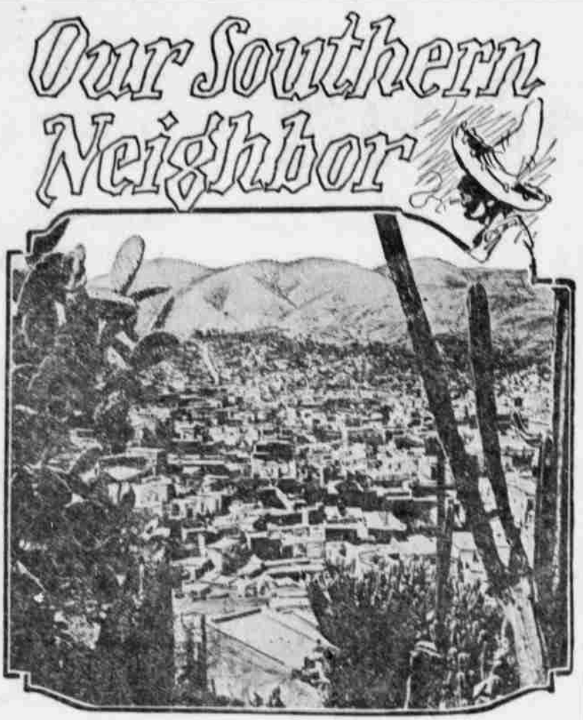
View of the City of Guanajuato.

(Prepared by the National Geographic Society, Washington, D. C.) EXICO, closest Latin-American neighbor to the United States, is known in detail to few residents north of the Rio Grande. The average American, familiar enough with Canadian provinces, would be hard put to tell whether Chiapas is on the Pacific or Atlantic; where Nayarit is; if Campeche is east or west; or oven to pronounce Aguascullentes or to name five of the twenty-eight commonwealths of our neighbor republic.