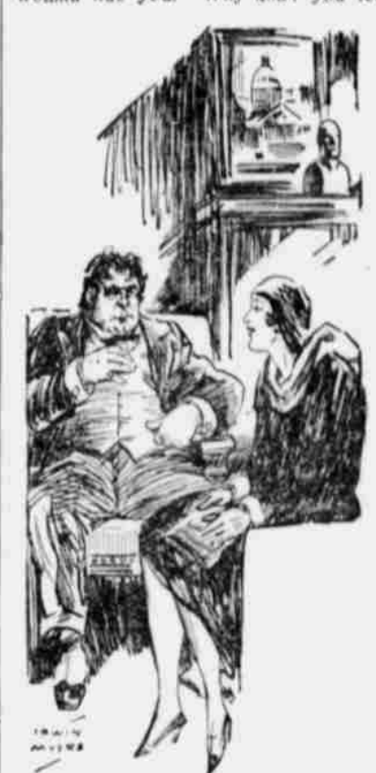
"So Our Friendship is to End With the Last Hundred Shares?"

"Then let me tell you-you can't have that boy. You'll ruln him-a woman like you. Why don't you let