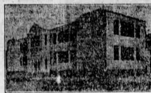
Ione School Building

To know one person who is also truly to be trusted will do more for a man's moral nature—yes, and even his spiritual nature—than all the sermons he ever heard or can hear.—George MacDonald.