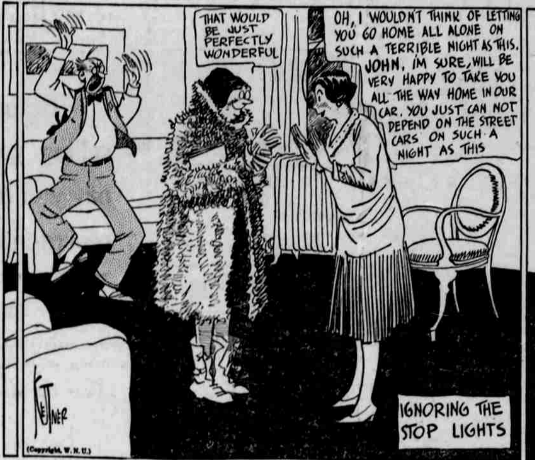
(Copyright, W. N. U.)