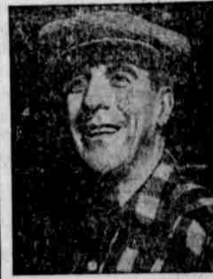
This kind of man wins no matter where you put him

"Well, that very night on the way home I got a bottle and within a week I felt like a different person. I wouldn't know myself. You can lick any job, even a night one, if you get the poisons out of your system regularly. Nujol sure did it for me!" That's the great thing about