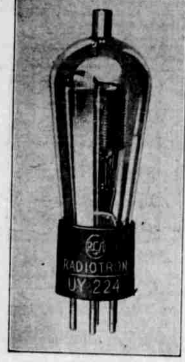
A four electrode, screen grid tube, with new features.

Radio amateurs have shown a quick response to the new rugged rectifier Radiotron with a low and constant voltage drop which just has been put on the market by the Radio Corporation of America. The new tube, Radiotron UX-866, is of the hot-cathode, mercury vapor type, and the makers assert it is establishing a new standard of performance for the amateur transmitter operating with a rectified plate supply.