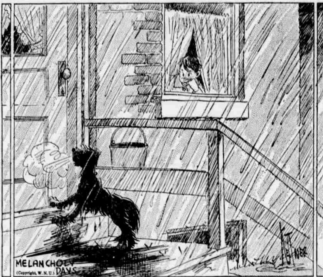
MELANCHOLY