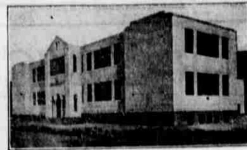
Ione School Notes