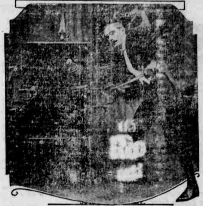
FRYE AND COMPANY

NELSON PRODUCE CO. WHOLESALE COMMISSION MERCHANTS 151 Front Street, Portland, Oregon.