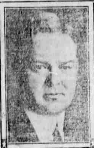
HERBERT HOOVER Our candidate for President