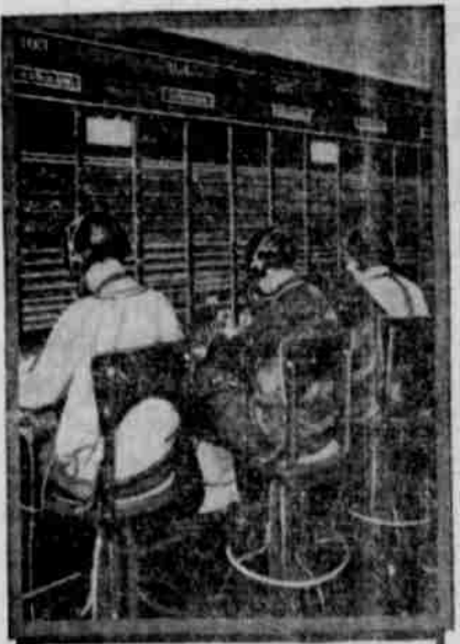
Switchboard Operators at New York Who handle Transatlantic Telephone Traffic