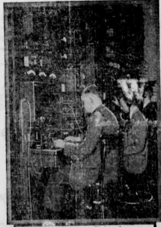
Transatlantic Telephone Control Room in New York City