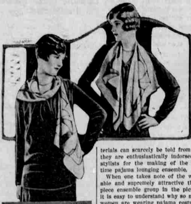
FEATURE FOR SPRING

It is difficult to believe that most of the new cottons and rayons are really what they claim to be—nothing more or less than simple washable fabrics. One would more readily credit them as belonging in the silk class. Just because many of these tub ma-