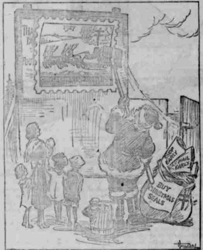
BUY CHRISTMAS SEALS