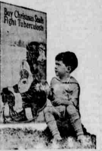
Christmas Seals Protect Health of Children

To buy Christmas seals is to broadcast benevolence, to radiate benefaction, to diffuse hope for health where disease most insidiously menaces. It is a simple little action, neither expensive nor difficult of performance, yet assuring its rewards.