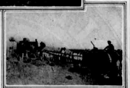
Increased production and improved methods lift the economic level.

A WORTH WHILE OBJECTIVE. Training children for self-support and future usefulness. "Its orphanage work is one of the finest pieces of constructive work I have ever seen."—Cardinal O'Connell.