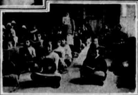
Every child goes to school. No illiterates among graduates.