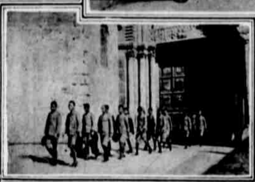
Coming from the Church of the Holy Sepulchre.

A RELIABLE ORGANIZATION, chartered by and responsible to Congress. "Easily the leader in the quality of its personnel."—Felix Warburg.