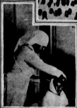
Skilled medical aid in case of accidents.

Food, clothing, shelter and loving care are provided for the homeless; school and religious training for the young and inexperienced.