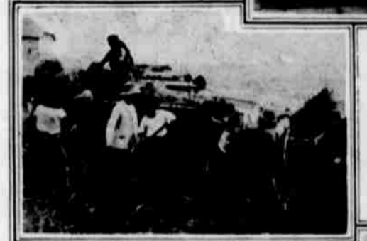
Harvesting the orphanage crop—double the local yield.