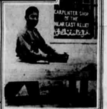
The carpenter shop at Nazareth.

Every orphan is taught some practical trade that will make self-support possible at sixteen.