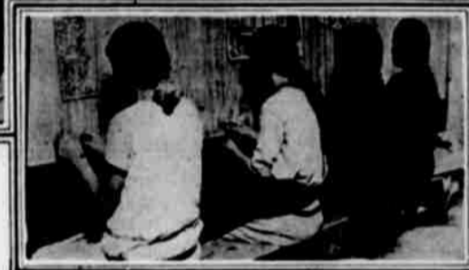
Making the "White House Rug" that was given President Coolidge, December, 1925.

"Good Wishes pay no bills." Give! Now! "He gives twice who gives quickly"