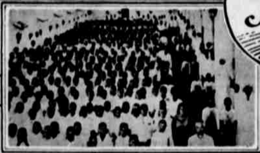
Where 1000 boys eat daily. 1/35 of the total number to be fed.

International Golden Rule Committee 151 Fifth Avenue, New York, N. Y.