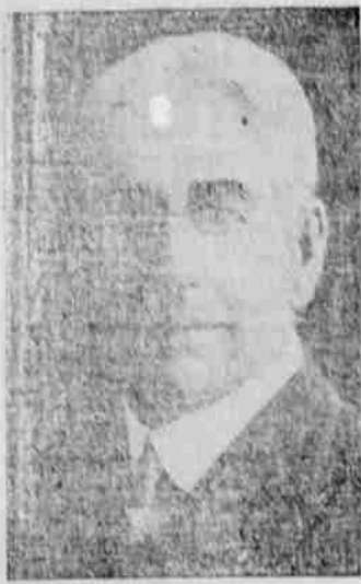
FREERICK STEIWER FOR U. S. SENATOR