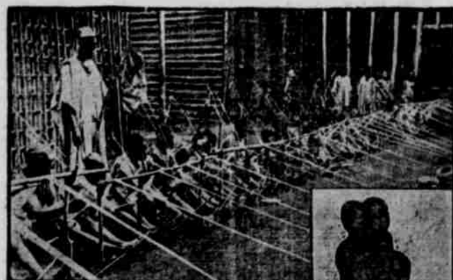
Weaving woollen with primitive looms in Africa. Note the Overseers.

(Letter from E. S. Berlett, Bloemfontein, O. F. S., Africa)