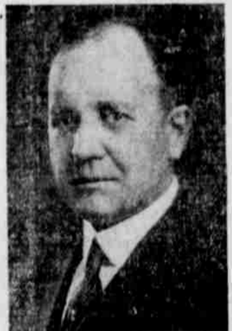
Robt. N. Stanfield