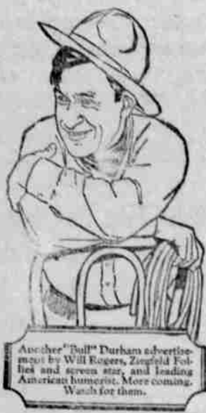
Another "Bull" Durham advertisement by Will Rogers, Ziegfeld Folies and screen star, and leading American humorist. More coming. Watch for them.

I see where some of the Foreign Nations say they are going to FUND their debt to America, and all the Papers are all excited about it. But the BULL'S EYE is a Paper that never misleads our readers (either one of them). FUNDING a debt means about the same thing as having a fellow that has owed you for years, come to you and say "I am going to make arrangements to take up that loan I owe you just as soon as I can collect it from some fellows who owe me." So don't be by any means get FUNDING mixed up with PAYING. The two have nothing in common. These Nations are just stalling until another War comes along and the first thing you know our debt will be four Wars behind. We have enough saved up to fight again, but they are using it now to enforce Prohibition.