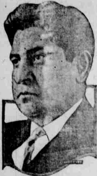
Recent portrait of Thomas D. Schall, blind congressman from the tenth Minnesota district, who was elected senator to succeed Magnus Johnson.