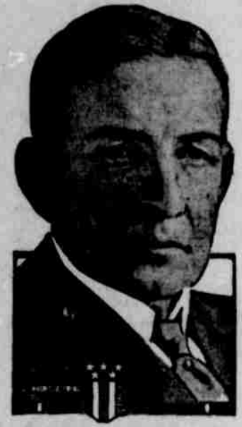
CHARLES G. DAWES

Indications were that the democrats had won in the border states of Tennessee and Kentucky. Without these two states the republicans were cer-