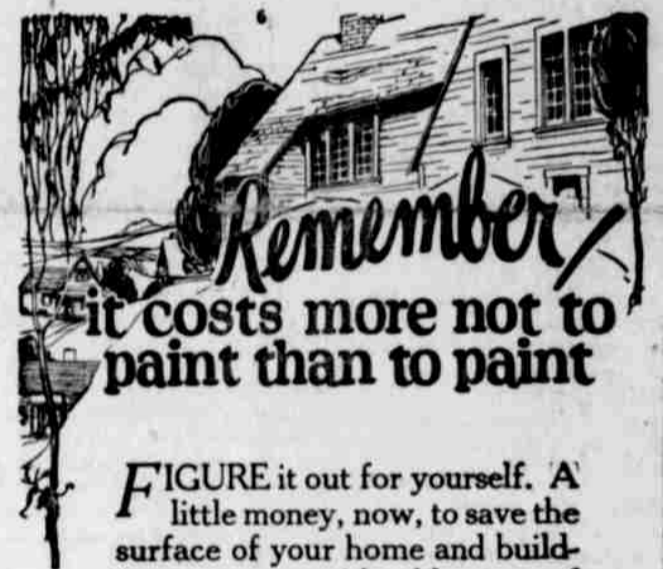
FIGURE it out for yourself. A little money, now, to save the surface of your home and buildings, or a considerable sum of money for repairs and replacements—which?

Unpainted surfaces leave the field clear for rain, wind and sun to do their damage. Ramshackle houses and out-buildings, once so new and storm-tight, gaping corner boards, warped and rotting window frames,—all directly result from failure to paint. Either you have to go in for expensive repairs, or let the entire building investment go. How much better and cheaper it would be to keep the buildings painted!