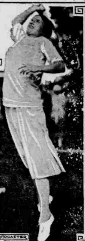
Elizabeth Ryan of London, English champion, threatens the national crown won by our youthful Helen Wills, Miss Ryan, formerly lived in California. She defeated Miss Wills in special play last week in straight sets—6-2; 6-0. Both are now working up toward the annual tourney.