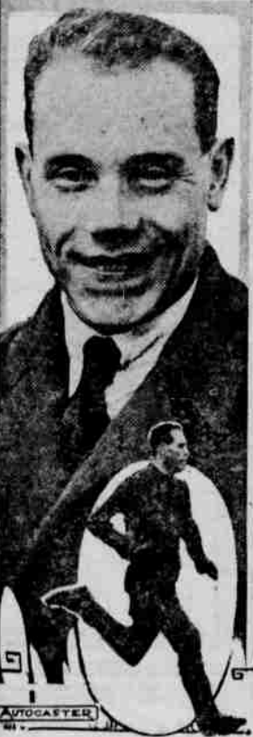
Paavo Nurmi, a Finland paper-hanger, is in the United States for a number of races. He is the champion Olympic games runner who is hailed as the greatest speedman of all times at any distance of one to twenty miles.