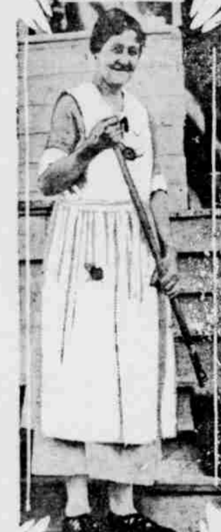
Mrs. Miriam Ferguson, wife of the former Texas governor, is aspiring to the same office and polled enough votes in the primaries to enter the fall elections...