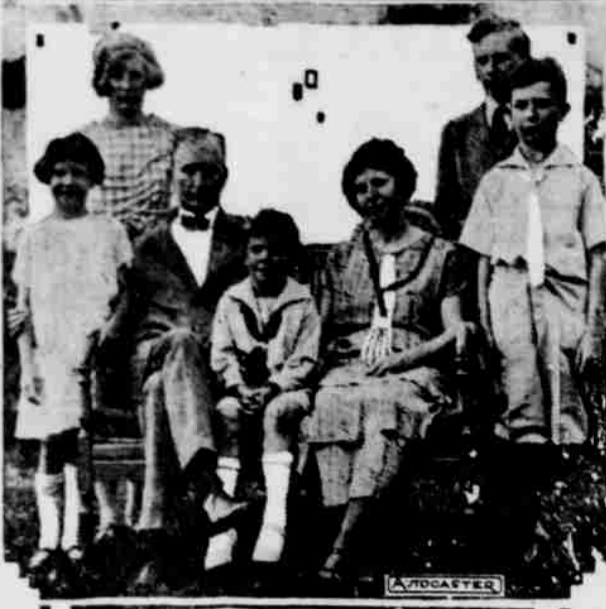
Senator Burton K. Wheeler of Mont., Vice Presidential candidate with La Follette, is the champion family man of the six candidates...