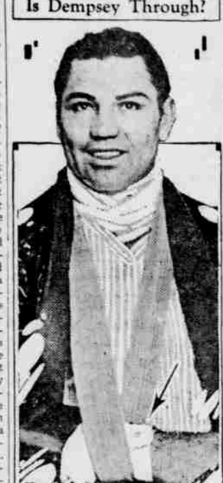
A passing speedster side-swiped Jack Dempsey's sedan—putting his car in the ditch and the champion in the hospital with a busted right arm. The boxing world is now wondering if Jack's "breadwinner" will carry the same old wallop.