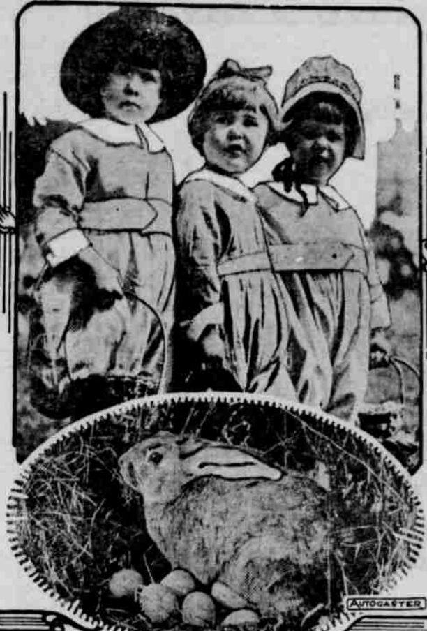
Does Mr. Bunny Rabbit lay Easter eggs? Well, thousands of kiddies all over the land will investigate on Easter morn—and to encourage them—we submit proof—as shown in the insert below.