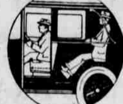
Both seats adjust forward and back for tall and short people.