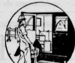
Big loading space by removing rear seat and upholstery.

WE have never seen the public flock to a car the way they are flocking to the new Overland Champion! It's a revelation—how much they wanted such a car! Study these pictures—you'll understand. Then realize that the low price also secures regular sliding gear transmission, all standard accessories, bigger new engine, Triplex springs, cord tires, and all Overland superiorities. Come in.