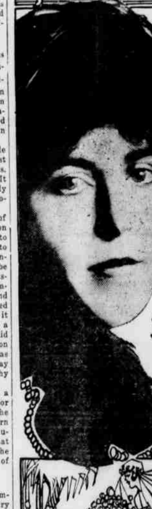
Mrs. Alice Sinclair, former musical comedy actress, who was born and raised in the Dakotas, is now Mrs. George J. Gould, New York banker and railroad man. They were married secretly in May and are now touring Europe. The first Mrs. Gould died last November.