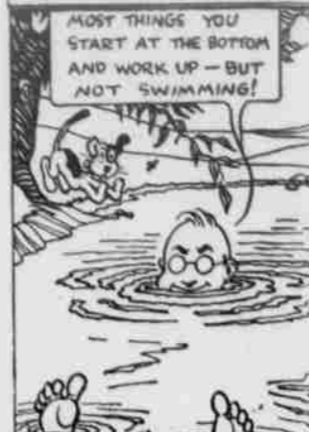
MOST THINGS YOU START AT THE BOTTOM AND WORK UP—BUT NOT SWIMMING!