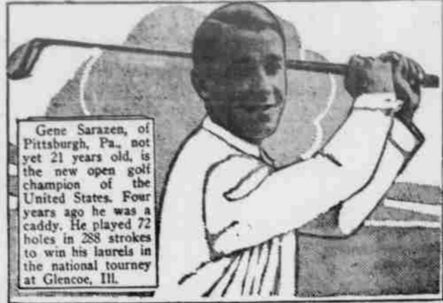
Gene Sarazen, of Pittsburgh, Pa., not yet 21 years old, is the new open golf champion of the United States. Four years ago he was a caddy. He played 72 holes in 288 strokes to win his laurels in the national tournament at Glencoe, Ill.