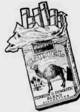
R. J. REYNOLDS Tobacco Co. Winston-Salem, N. C.

Let your own taste be the judge. Try Camels for yourself. A few smooth, refreshing puffs and you'd walk a mile for a Camel, too.