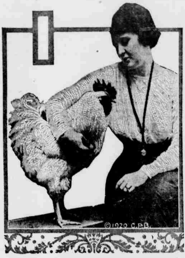
Poultry raising is one of our largest national industries. The high price of eggs and meat makes it an extremely profitable business. Generous premiums for all kinds of poultry will be awarded by the big Morrow County Fair, Heppner, Ore., Sept. 15 to 17.