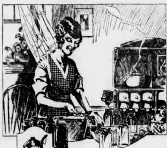
PEARL OIL Makes canning easier