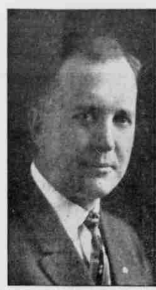
United States Senator Elect of Oregon.