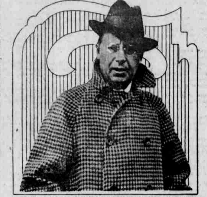
A recent photograph of James Middleton Cox during his speaking tour in the west