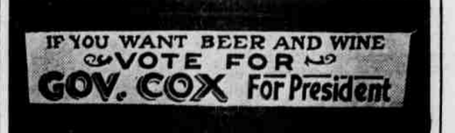
Hung conspicuously in a saloon in Chicago the above sign is creating considerable comment.