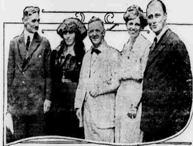
Left to right they are William G. McAdoo, Mrs. McAdoo, Secretary of the Navy Daniels, Mrs. Franklin D. Roosevelt and Franklin D. Roosevelt at their home in New York City, where the ex-assistant secretary of the navy was officially notified of his nomination for the vice presidency.