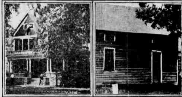
Front porch and lawn of the Republican Presidential candidate's home in Marion, Ohio, which has already been the scene of enthusiastic gatherings and which promises to become the center of Senator Harding's campaign.