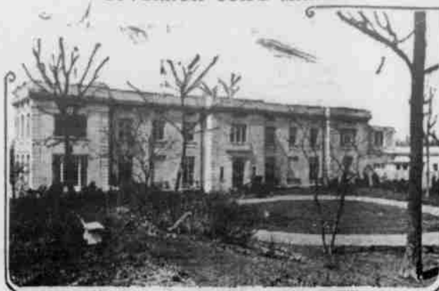
"Trail's End," the home of Governor James M. Cox, Democratic candidate for president, near Dayton, O.