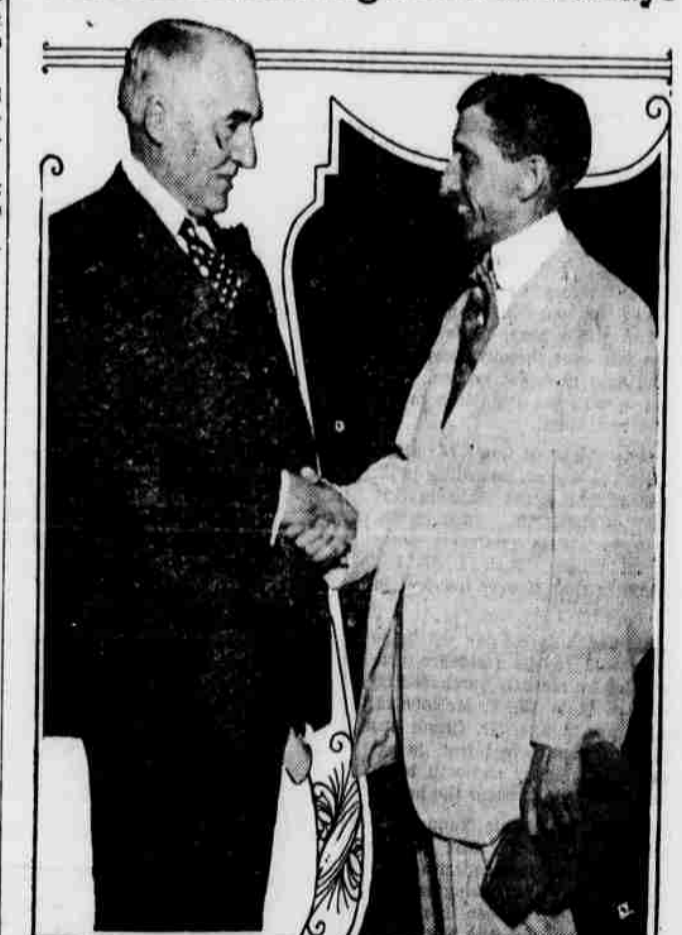
The Republican nominee receiving the congratulations of the man who will manage his campaign. Senator Harding has been selected to head the Republican ticket and Will H. Hays is Chairman of the Republican National Committee.