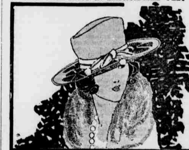
This chic fall creation is of hand-embroidered felt, the brim alone being the field for design. A rather narrow band encircling the high crown and bowed in front. The ends of the ribbon finished with either little balls or tassels. The under side of the brim is faced with delicate-tinted silk, preferably pink or blue, giving a beautiful cast of reflected light upon the face.

association, which has just purchased a $49,000 plant on the waterfront.