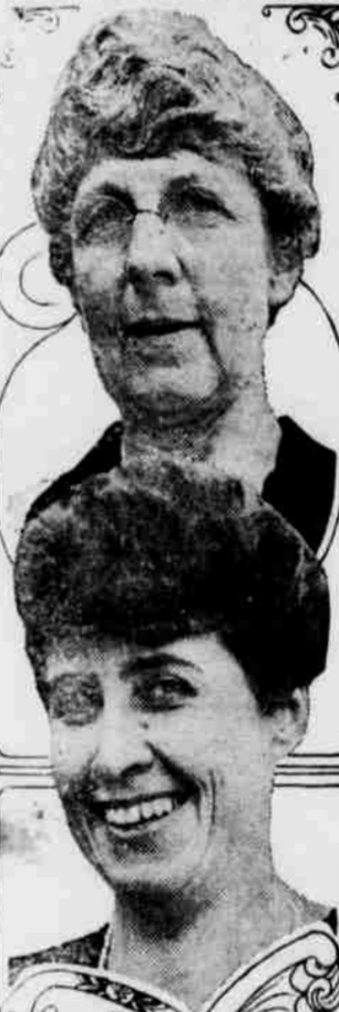
A new picture of Mrs. Warren G. Harding, wife of the Republican presidential nominee and Mrs. Calvin Coolidge, wife of the vice presidential nominee. Both pictures were taken since the nominations.