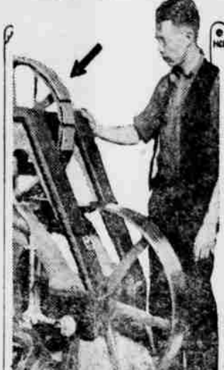
The Department of Agriculture at Washington has some funny jobs assigned to it. One of them is the testing of the wearing qualities of leather. This big machine was constructed for that purpose. Pieces of material fastened on a wheel are "worn" against a sanded belt—the same pressure as a man's step.