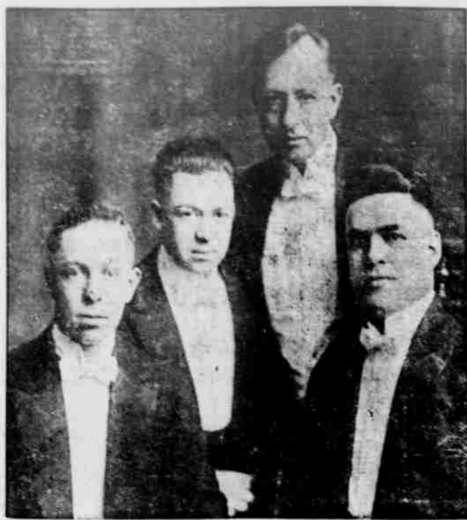
THE ITHACA QUARTET

There is a charm about a good male quartet that does not extend to any other sort of musical company. To the Ithacans is given the important task of setting the pace for the Chautauqua program this summer. The management sought long and carefully before this group of splendid singing entertainers was chosen for the opening day.