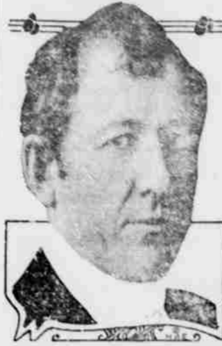
HON. PHILIP PITT CAMPBELL

Representative Campbell, of Kansas, occupies the important position of chairman of the Committee on Rules and is a busy man, as his committee is in session almost daily. He is the author of the bill just reported out by the House Committee on Labor creating a Woman's Bureau in the Department of Labor. This is a measure to formulate standards and policies which shall promote the welfare of wage-earning women, improve their working conditions, increase their efficiency and advance their opportunities for profitable employment. It will affect about 20,000,000 women employed in the industrial life of the country.