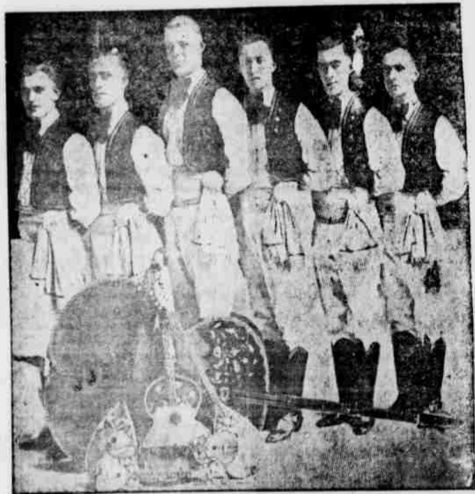
SERBIAN TAMBURICA ORCHESTRA

The Serbian Tamburica Orchestra, soon to be heard here on the Lyceum Course, is the only organization of its kind in America. It is unquestionably one of the most unusual and attractive musical companies on the platform. These six young Serbians appear in the bright colorful costumes of their native land, singing and playing their Slavic music, extraordinary in its exquisite sweetness and thrilling power. They use various sizes of the tamburica, the household instrument of their people for generations. While similar to the mandolin, guitar and banjo, it possesses larger musical possibilities because of greater life and sweetness of tone.