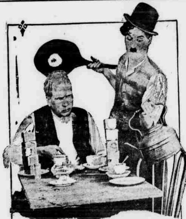
Charlie Chaplin in "Sunnyside"

A city built and burned. You won't witness such a production again in months. It's bigger than anything you've seen this season. No man, woman or child should miss it. IT'S WONERFUL! 30 and 50 Cents