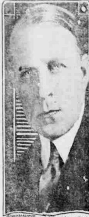
DAVID I. WALSH

It took a bachelor to be the first Democratic U. S. senator from Massachusetts since the Civil War. He is Senator David I. Walsh, junior member, his colleague being Senator Henry Cabot Lodge, Republican. Lodge is the senior member. Walsh's personal popularity helped put him across. It is said.