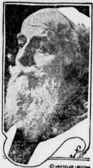
Bartholomeus famous French sculptor won undying fame in the modeling of a statue, "The Dead," which stands in the national cemetery at Paris. The United States has now hired him to make a replica of this statue, to be placed near the statue of Liberty in New York harbor.