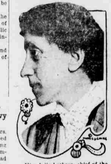
Miss Julia Lathrop, chief of the Children's bureau, U. S. Department of Labor, is aiding in the movement to bring instruction in maternity hygiene to the rural mother, and to make it possible for women on farms and in small towns to receive the same care and attention city mothers have when baby comes.