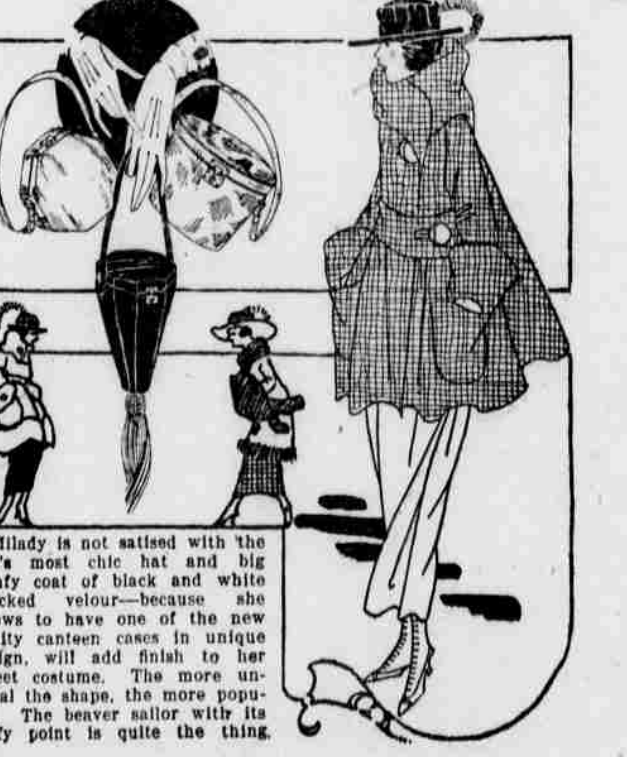
Milady is not satisfied with the fall's most chic hat and big comfy coat of black and white checked velour—because she knows to have one of the new vanity canteen cases in unique design, will add finish to her street costume. The more unusual the shape, the more popular. The beaver sailor with its fluffy point is quite the thing.