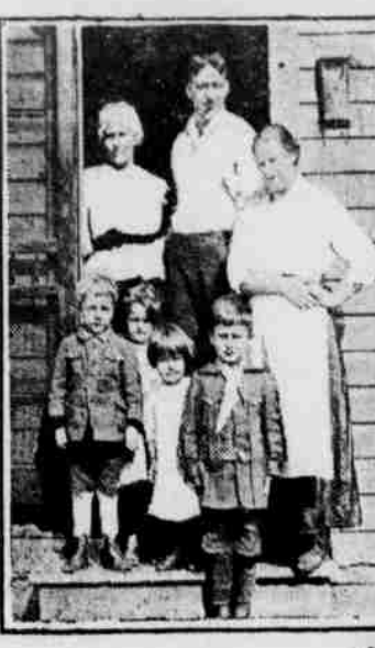
The nation and world are watching results in the big steel strike now under way, many experts predicting that this is at least the start of the show-down which had to come before a break in living and working conditions in the U. S. could change. These pictures show scenes from the big steel centers in Pennsylvania and Ohio as the strike was launched. On the left is a typical steel worker and his family, the first vacation he has had with them since before the war—due to the seven-day week effective in the steel industry. Upper right shows the interior of a steel mill, a big "squeeze" roller at work. Lower picture shows a group of steel workers as they went out on strike near Pittsburgh.