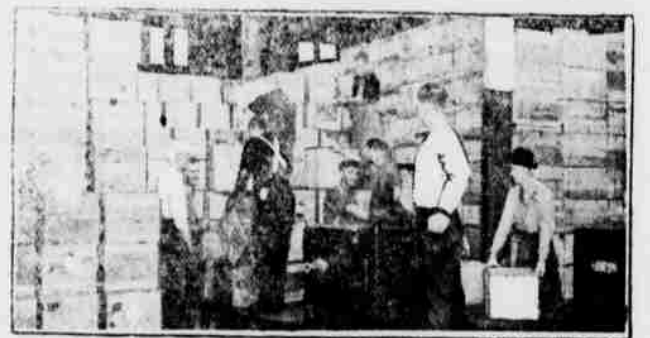
Old high cost of living is getting a jolt as Uncle Sam's surplus food stuffs bought up for war purposes are. The surplus will be placed in the hands of consumers through various outlets. Here shows immense stores for five big eastern cities. Bacon at 34 cents—beef hash at 23 cents—shows the immense saving possible for the consumer.