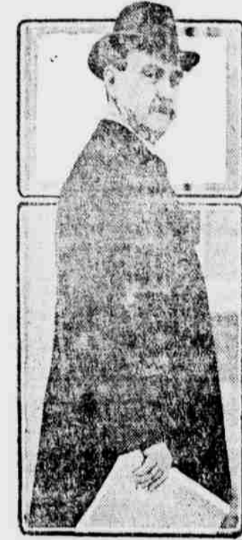
The Two Big Jobs of the Hour.

LOST —A sorrel mare colt, coming year old; long, white stripe in face, branded JB connected with bar under it on left shoulder. Notify E. BERGSTROM, Ione, Oregon. 1m