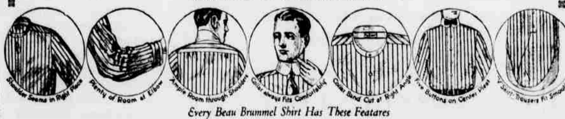
Every Beau Brummel Shirt Has These Features